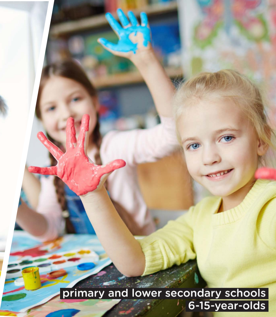
primary and lower secondary schools 6-15-year-olds