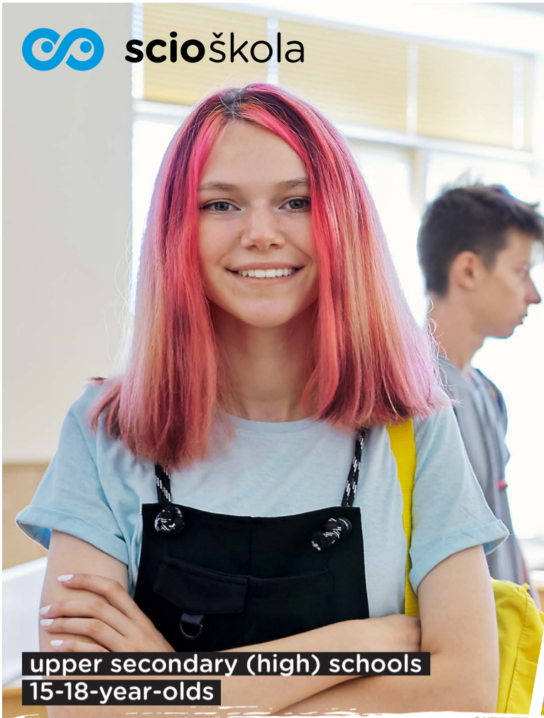
upper secondary (high) schools 15-18-year-olds